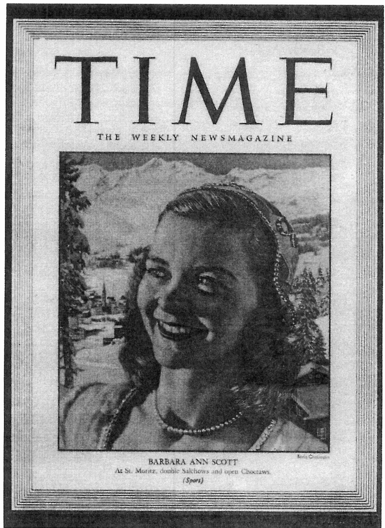
TIME Magazine Cover